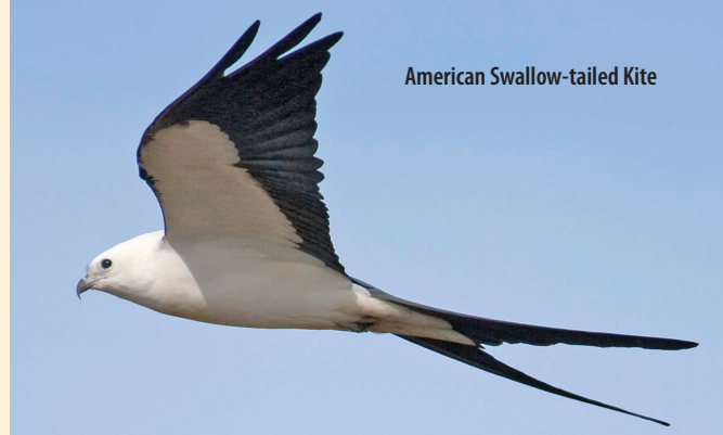
American Swallow-tailed Kite