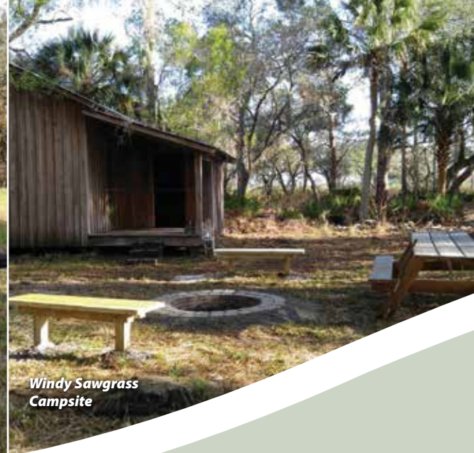
Windy Sawgrass Campsite