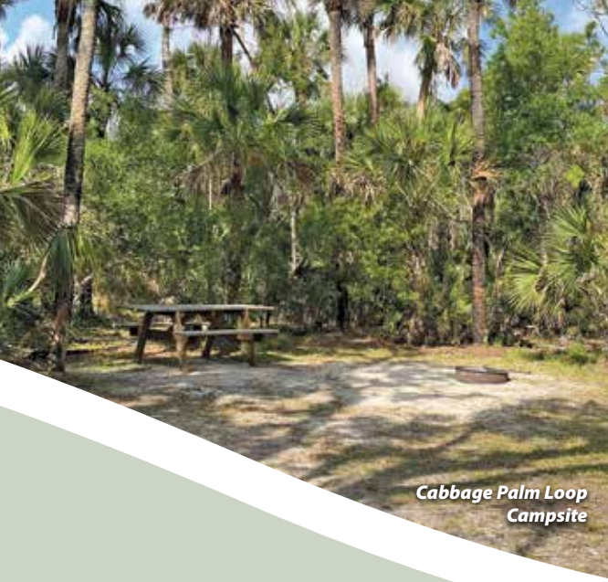
Cabbage Palm Loop Campsite