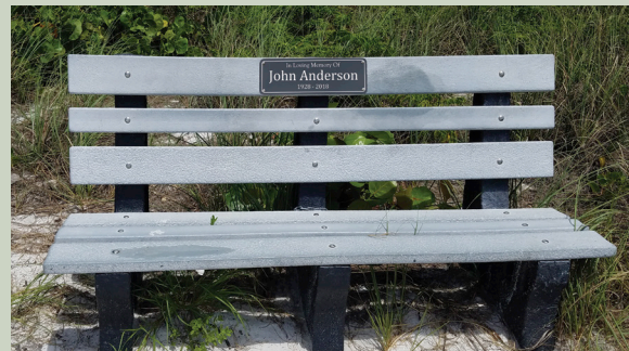
Recycled plastic bench

Concrete table (only select parks) $2,500